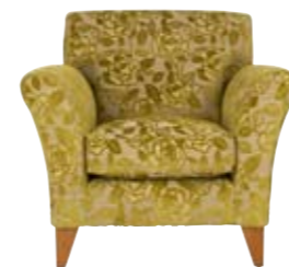
ARMCHAIR H84cm W92cm D94cm