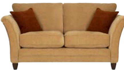
2 SEATER SOFA Including 2 small scatter cushions H91cm W180cm D94cm