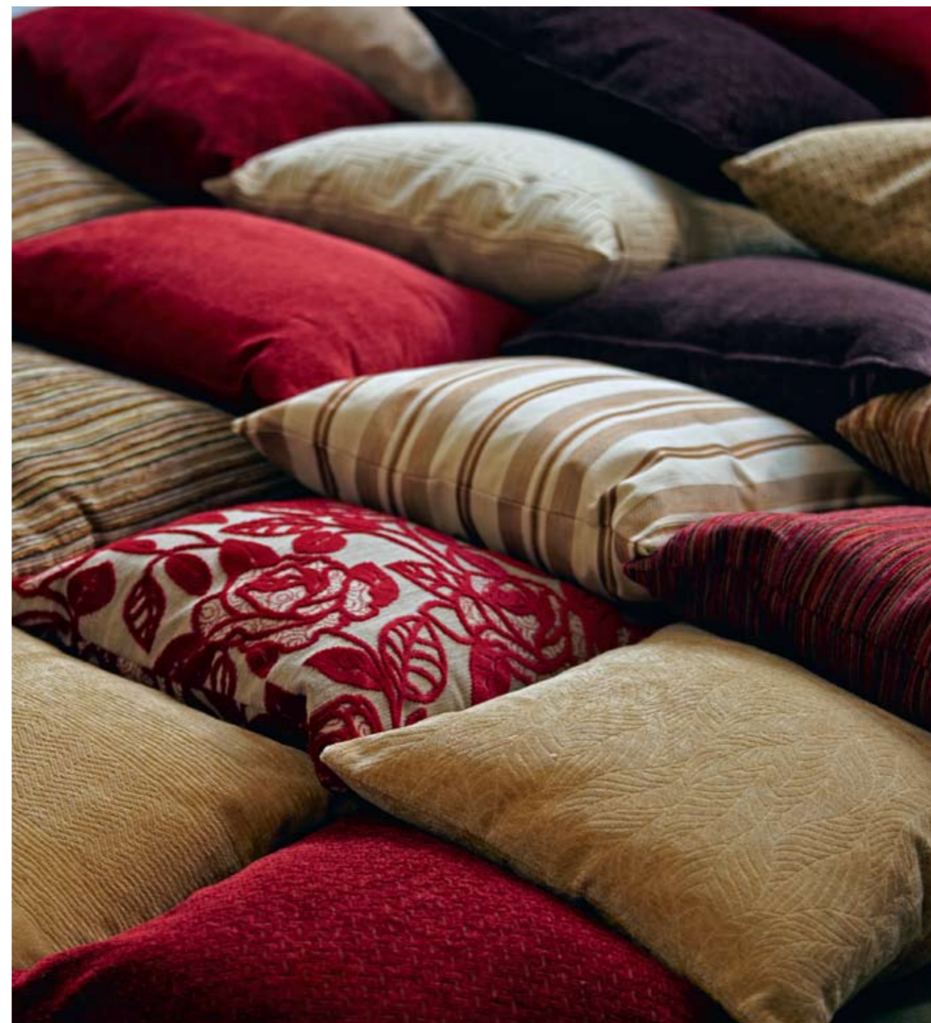
Left: Brookwood Armchair in Mira Beige and Brookwood Armchair and Footstool in Casa Brick. Right: Scatter Cushions from the selection available.