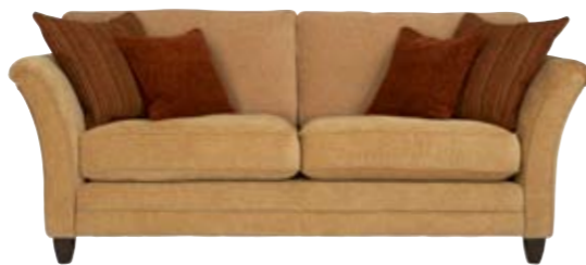
LARGE 2 SEATER SOFA Including 2 small and 2 large scatter cushions H91cm W210cm D94cm