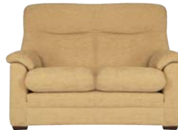
2 SEATER SOFA H99cm W138cm D100cm