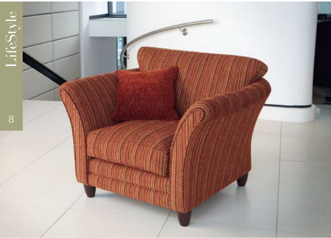
Above: Elmsworth Chair in Marlowe Brick.