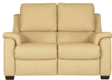
2 SEATER SOFA H100cm W140cm D100cm