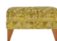
FOOTSTOOL H47cm W64cm D37cm