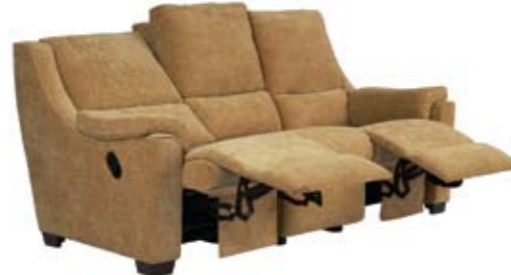
3 SEATER DOUBLE RECLINER AVAILABLE IN MANUAL AND POWER OPTIONS H100cm W194cm D100cm Fully Reclined 160cm