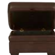
STORAGE FOOTSTOOL H47cm W73cm D60cm