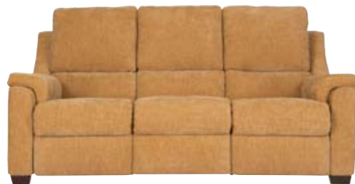
3 SEATER SOFA H100cm W194cm D100cm