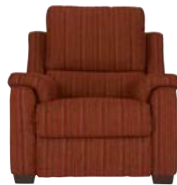
ARMCHAIR H100cm W96cm D100cm