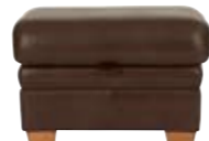
STORAGE FOOTSTOOL H50cm W73cm D60cm