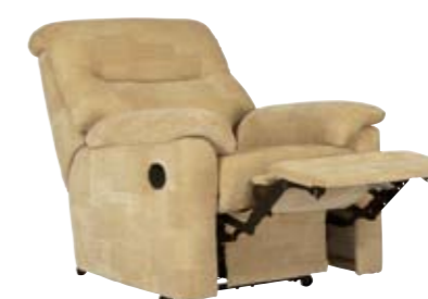
POWER LIFT AND RECLINE H98cm W90cm D98cm Fully Reclined 165cm

We have tried to be as accurate as possible in the presentation of information. However, some dimensions shown should be regarded as approximate only, due to the nature of upholstery fabrics used. Parker Knoll has a policy of continual development and improvement, and therefore advises that current specifications should be checked prior to ordering. Parker Knoll reserve the right to alter specifications and to discontinue models and fabrics without notice. Due to varying lighting conditions during photography and limitations in film and printing technology, colours in this catalogue may vary from actual materials. Some cushions, rugs and accessories shown in the brochure are not manufactured by Parker Knoll.