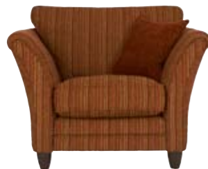
ARMCHAIR Including 1 small scatter cushion H91cm W110cm D94cm