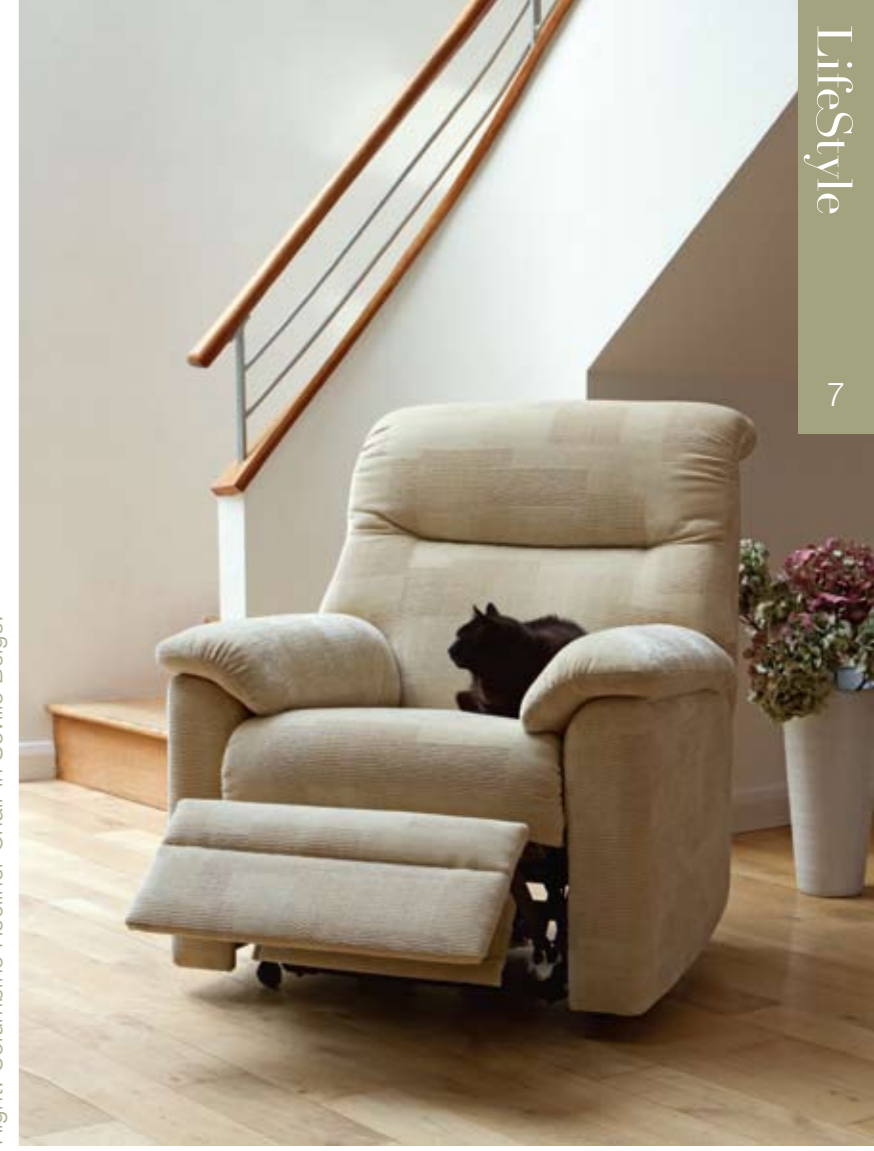
Right: Columbine Recliner Chair in Seville Beige.