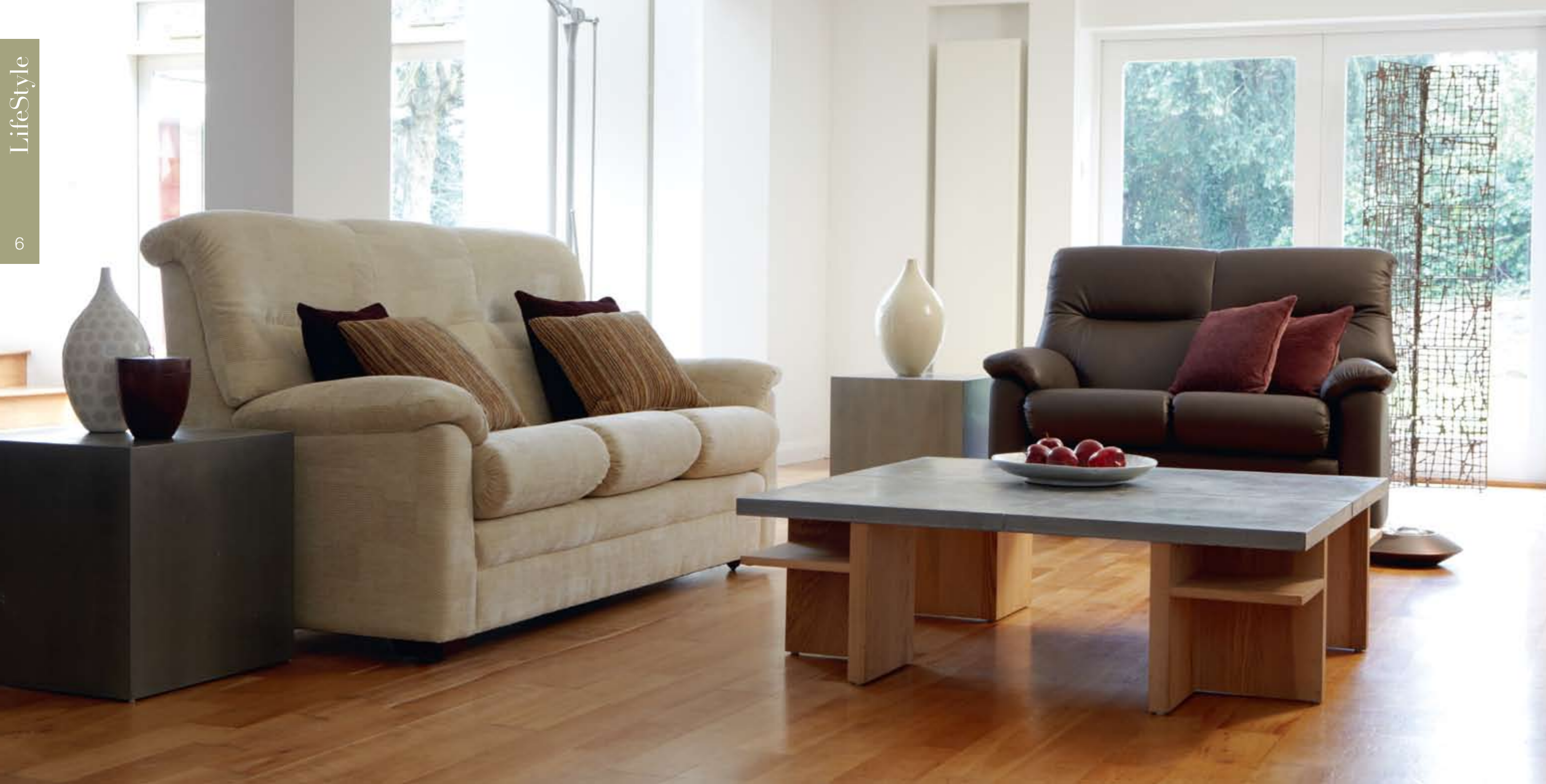
Left: Columbine Three Seater Sofa in Seville Beige and Columbine Two Seater Sofa in Como Chocolate.