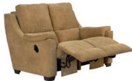
2 SEATER DOUBLE RECLINER AVAILABLE IN MANUAL AND POWER OPTIONS H100cm W140cm D100cm Fully Reclined 160cm