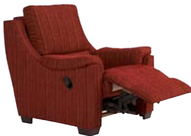
ARMCHAIR RECLINER AVAILABLE IN MANUAL AND POWER OPTIONS H100cm W96cm D100cm Fully Reclined 160cm