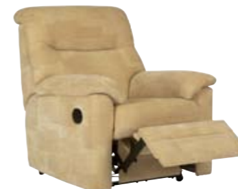
POWER RECLINER H98cm W90cm D98cm Fully Reclined 165cm