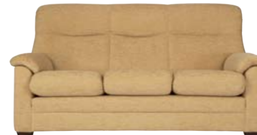
3 SEATER SOFA H99cm W188cm D100cm