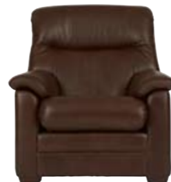
ARMCHAIR H99cm W93cm D100cm