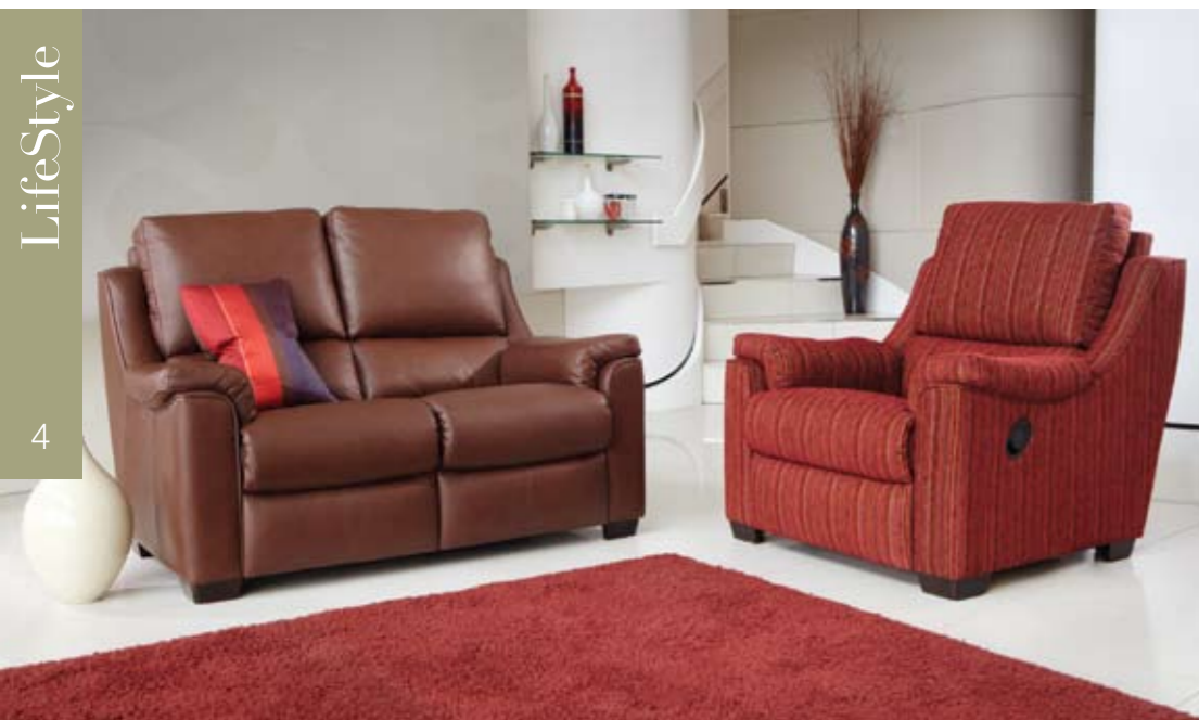
Above: Albany Leather Two Seater Sofa in Como Chocolate, Albany Recliner Chair in Marlowe Red.