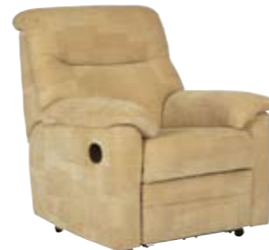
MANUAL RECLINER H98cm W90cm D98cm Fully Reclined 165cm