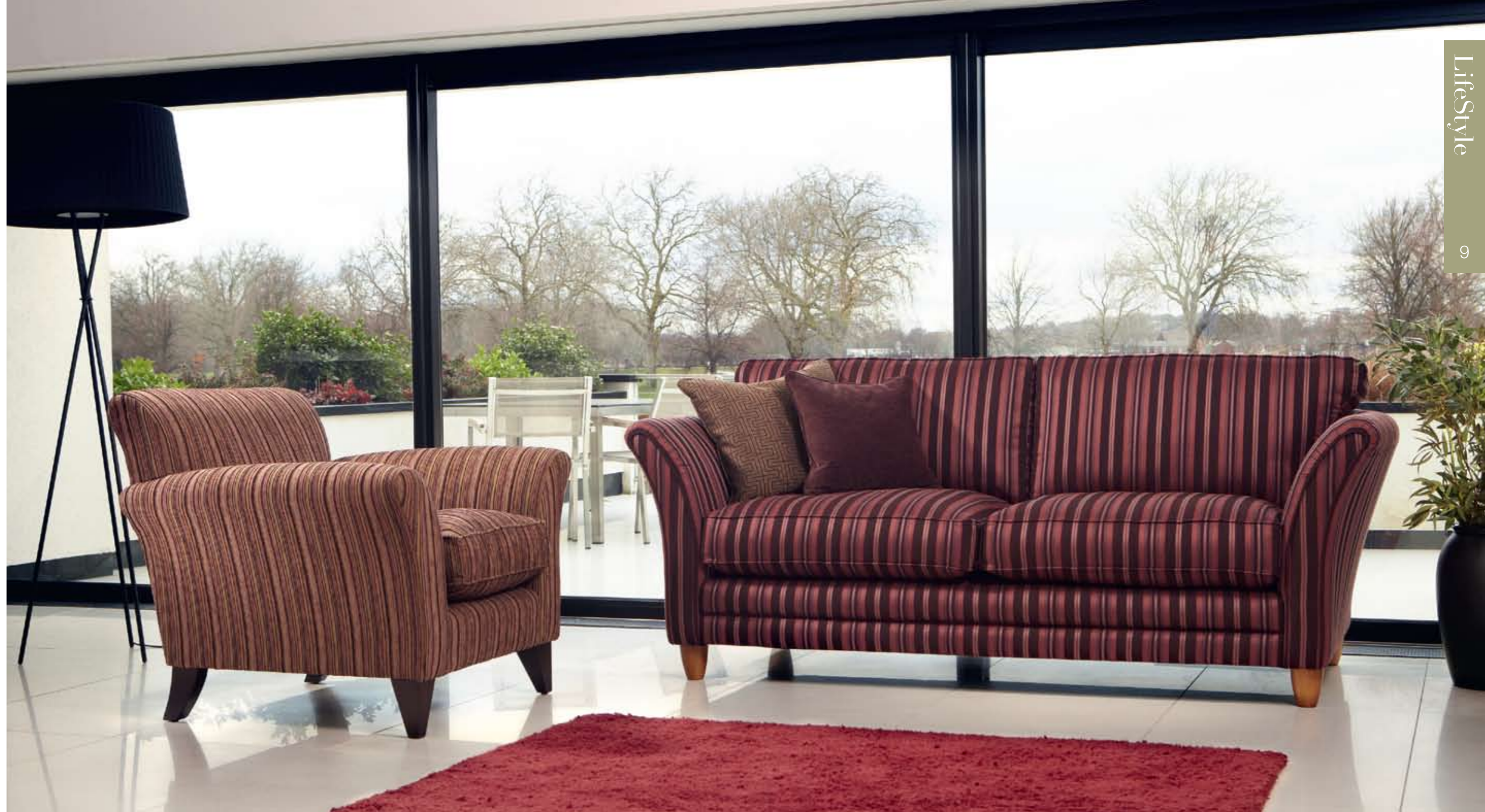
Right: Elmsworth Large Two Seater Sofa in Rosemary Mulberry and Brookwood Chair in Marlowe Mulberry.