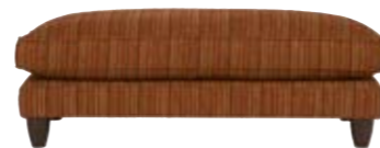
FOOTSTOOL H42cm W108cm D60cm